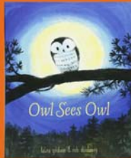
OWL SEES OWL by Laura Godwin