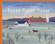
SLEEP TIGHT FARM by Eugenie Doyle