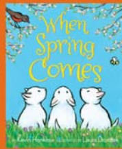
WHEN SPRING COMES by Kevin Henkes