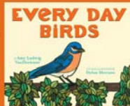
EVERY DAY BIRDS by Amy Ludwig