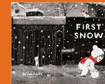
FIRST SNOW by Bomi Park