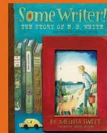
SOME WRITER! by Melissa Sweet